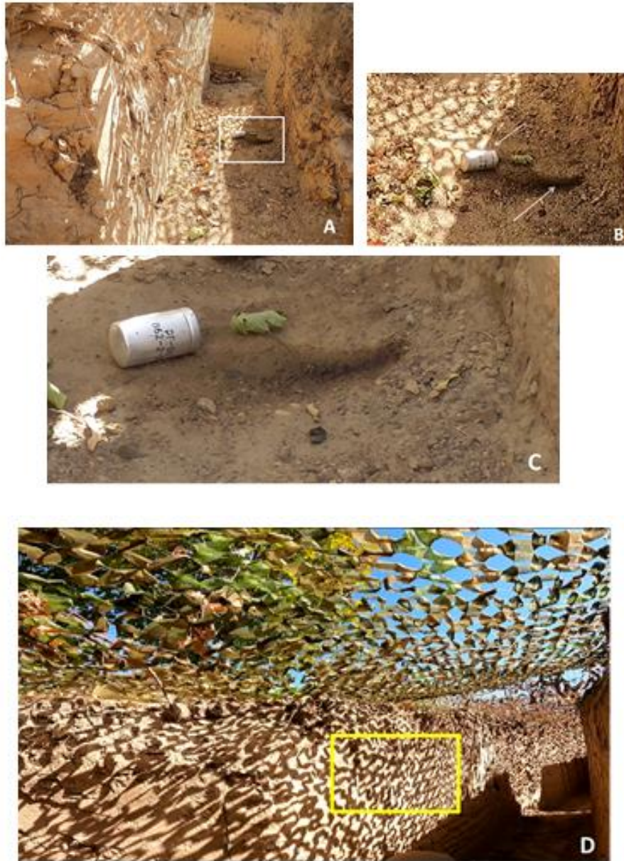
FIGURE 2: SNAPSHOTS FROM VIDEO RECORDINGS DURING THE COLLECTION OF SAMPLES IN THE FIELD. A: THE GRENADE ON THE GROUND IN THE TRENCH; B: A DARK SPLATTER NEXT TO THE GRENADE; C: VISIBLE MARKINGS ON THE GRENADE; D: LOCATION OF COLLECTION OF THE CONTROL SOIL SAMPLE